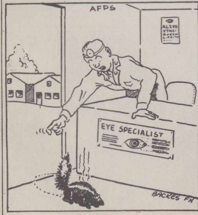
"Here Kitty, Kitty!"

SCO: "Then what are you doing here in the hospital?" Recruit: "Rheumatism."