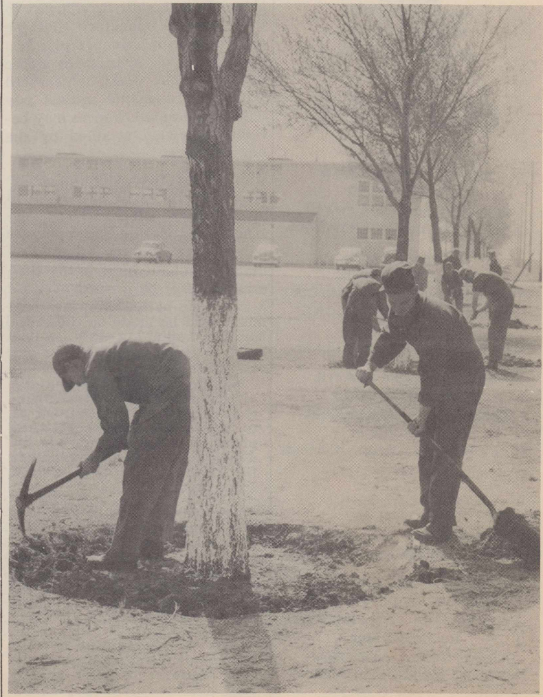
A familiar sight around Reese AFB is men working on base "beautification" detail. Like mail carriers, the men brave all kinds of weather, including dust storms, to complete their jobs on schedule. Shown above are some of the men excavating topsoil around the trees across from Headquarters.