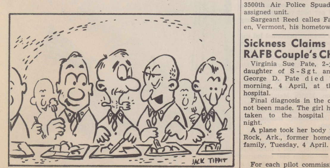
WHAT WUZ YOU SAYING BOUT THE MESS-HALL BEING TOO CROWDED ? "

Airman: "How long can a man live on his nerve alone?" WAF: "I dunno. How old are