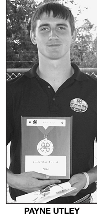
Gold Star Award