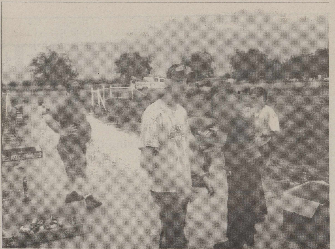
BHRC July 4th Celebration! Members of the Bronte Volunteer Fire Department set up the fireworks display held during the Bronte Health & Rehab Center's annual Independence Day celebration.