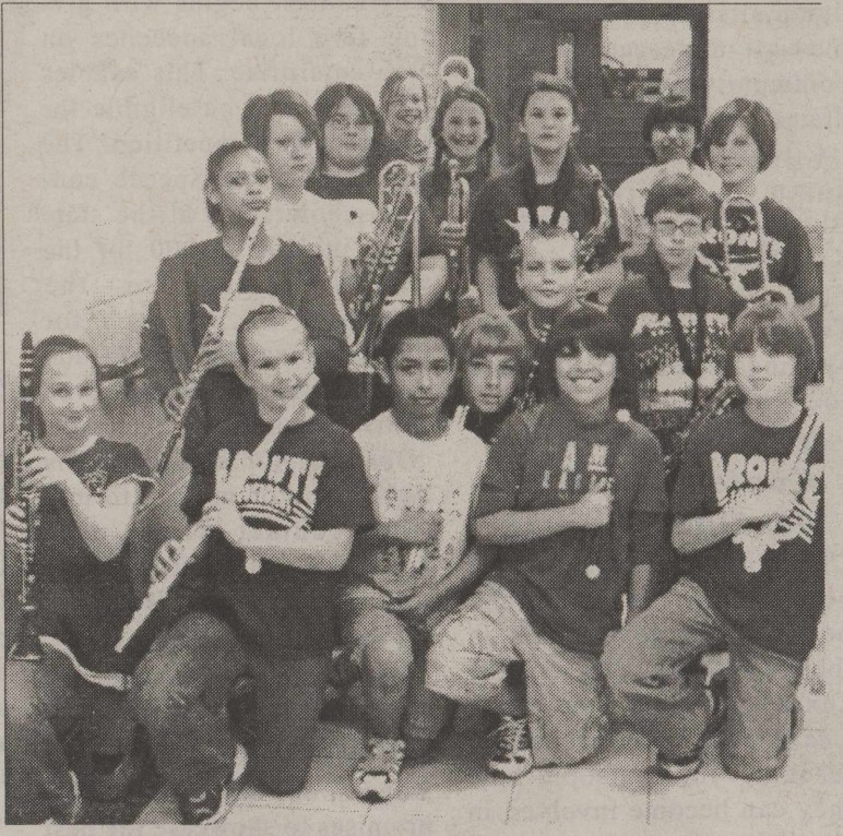
Bronte 5th Grade Band