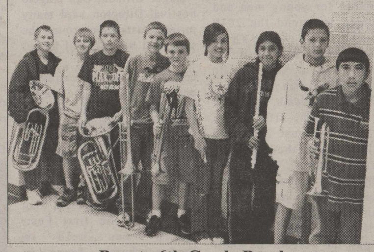
Bronte 6th Grade Band

for the ACT test and www.collegeboard.com for the SAT test. Fee waivers are also available for students who are on free or reduced lunches. In order to avoid late fees, please register by March 5, 2010 for the ACT test and March 25, 2010 for the SAT test. For more