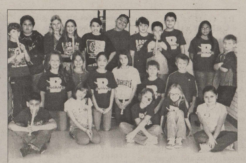
Bronte 4th Grade Band