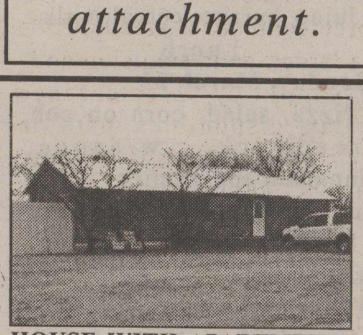
ACREAGE WITH RIVER FRONTAGE! 3 Bedroom 2 Bath Country Home with 20' x 30' Large Barn and Animal Pens! $70's!!!

HOUSE WITH APARTMENT! 3 Bedroom Home with updated Siding, Windows and Doors! Hardwood Floors! Privacy Fence and Double Carport! $60's!!!