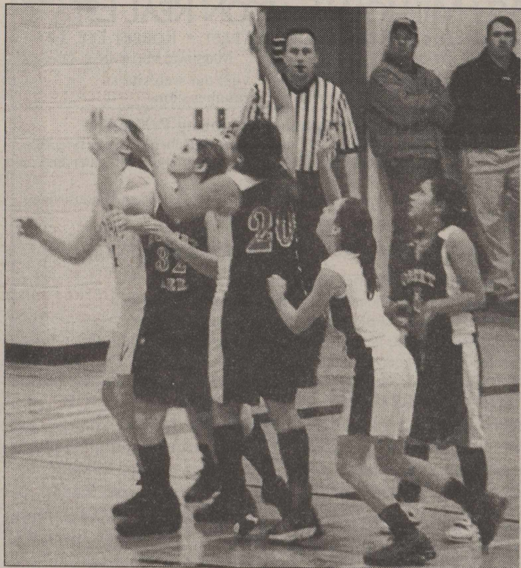
RLHS Basketball! The Robert Lee High School Steers (right photo) and Lady Steers (above photo) basketball teams took on the Water Valley Wildcats recently.