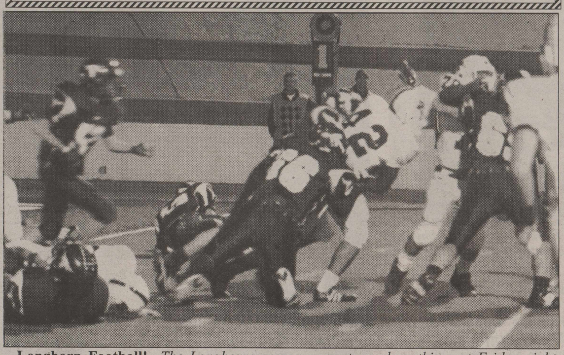
Longhorn Football! The Longhorns season came to a close this past Friday night, November 14, as the Horns took on the Roscoe Plowboys in the first round of the post season.