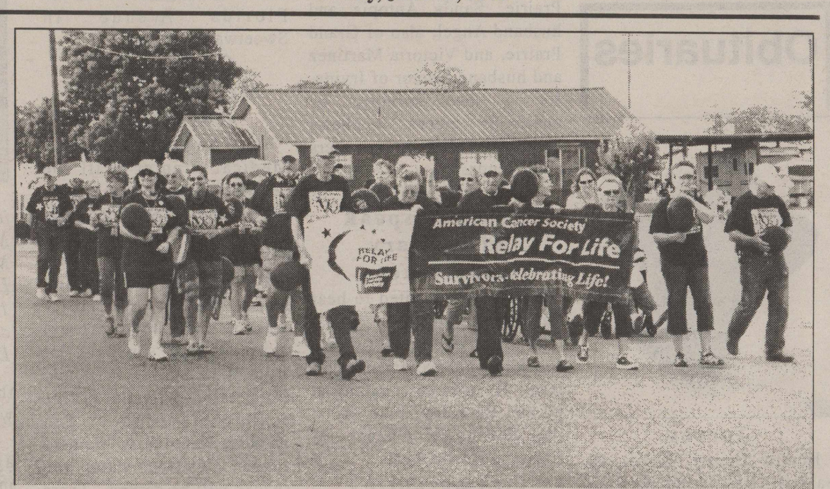
Survivors! Over 50 survivors participated in the Survivors Lap at the 4th annual Coke County Relay for Life in Bronte this past weekend. The event was a huge success, with about $33,000 being raised for cancer research, education, advocacy and services.

Mark your calendar now for Saturday, June 28, at the Creek