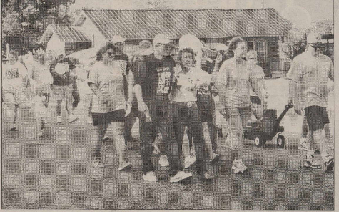
Relay for Life! Many local residents participated in the 4th annual Coke County Relay for Life recently. The 2008 Super Team trophy went to the Country Stars who brought in $2,180.40. Other nationally recognized bronze fundraising teams were Sorosis Club, Heavenly Stars, RL Friends for a Cure, Shooting Stars and the Purple Princesses.

For admission prices or to reserve the pool, call 450-5204 or 325-201-4227.