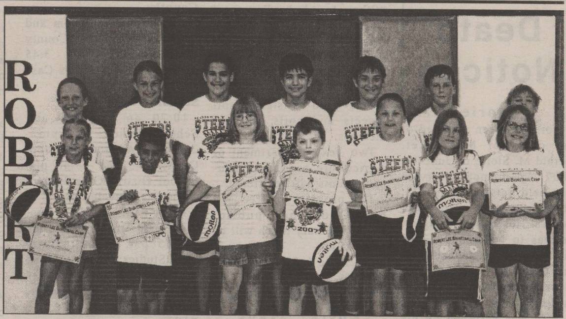
Basketball Camp! Students from Robert Lee and around the area participated in the Robert Lee Basketball Camp, the week of June 4-8. They worked on basketball fundamentals and had a great time competing for awards in the hot shot, free throw and layup contests.

T-shirts Light Brown, Tube Socks, Flashlights/batteries, Snacks, Visine, Chapstick, Gum, Jerky, Cup of Soups, Underwear, Baby wipes (easily carried type), Movies DVD"s (cheerful themes), Small bar soap, Toothpaste, Toothbrushes, Shampoo