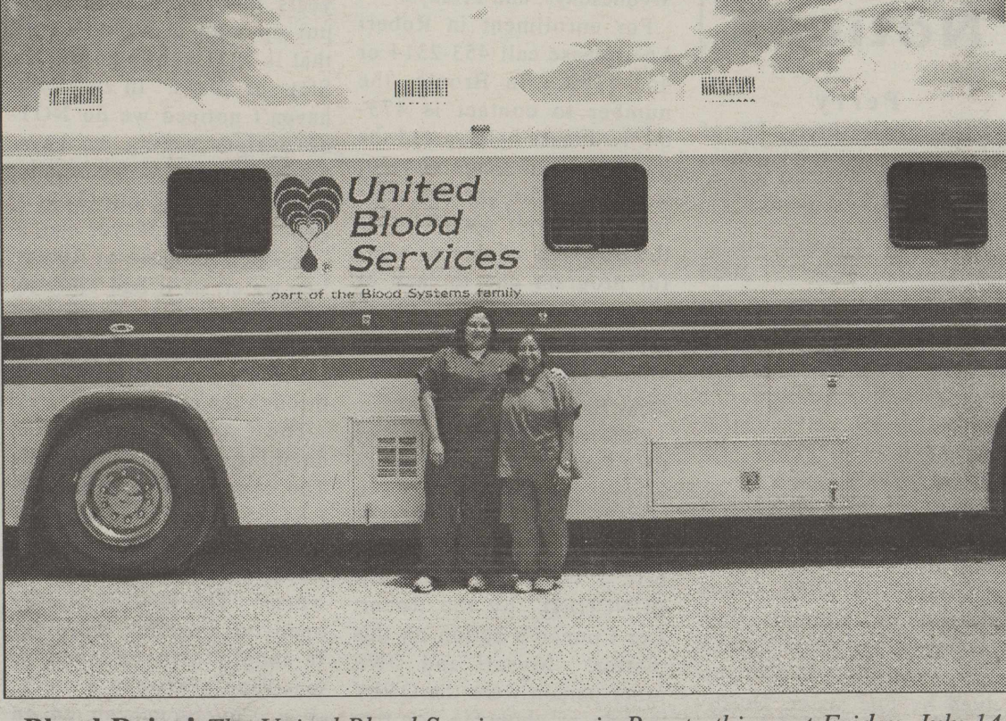
Blood Drive! The United Blood Services were in Bronte this past Friday, July 14, for a city-wide blood drive. The blood drive was very helpful to United Blood Services due to the increase in the demand for blood and low supply. Pictured above are two of the nurses from UBS who gave their time for a worthy cause.

A Bronte High School If you are unable to attend Alumni Reunion is scheduled for Saturday, July 29, at the Bronte Community Center. the mail before you will be Muddy Creek, from 7 pm -All classmates, If you are new to the district teachers, friends and family