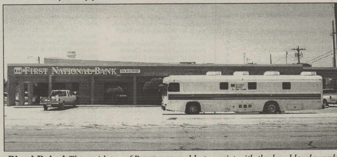
Blood Drive! The residents of Bronte were able to assist with the low blood supply in the Concho Valley. They donated 13 units of blood to the United Blood Services in San Angelo.

Any 4-H member who wishes to show lambs or goats please contact the Extension office in Robert Lee at 453-2461 if you need assistance in selecting your projects. We are presently looking at several producers for selections.