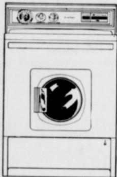
Model LRG 787-1

$184 PLUS TAX WITH FREE NORMAL INSTALLATION