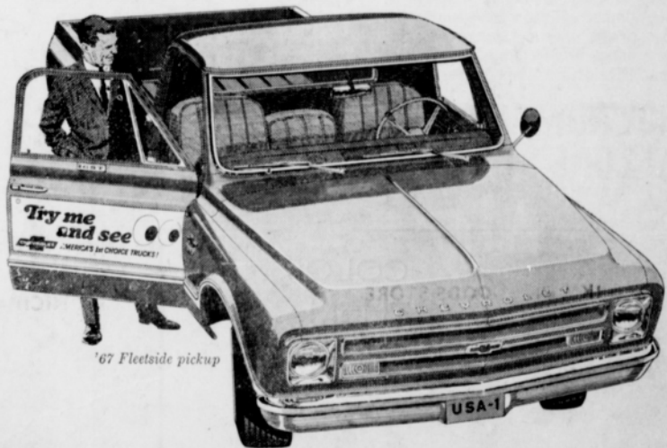
'67 Fleetside pickup

If you're a fussy truck buyer, try this '67 Chevy pickup! Your Chevrolet dealer has a demonstrator waiting to show you its sleek new look, burly new build and bright new cab. (Not to mention the smooth ride and easy handling.) It's the latest in pickups—try it and see for yourself!