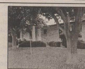
BRICK WITH METAL ROOF! Approximately 28 x 24 Den with Fireplace! Kitchen has appliances & skylight! Double Car Garage/shop! Apartment in back!