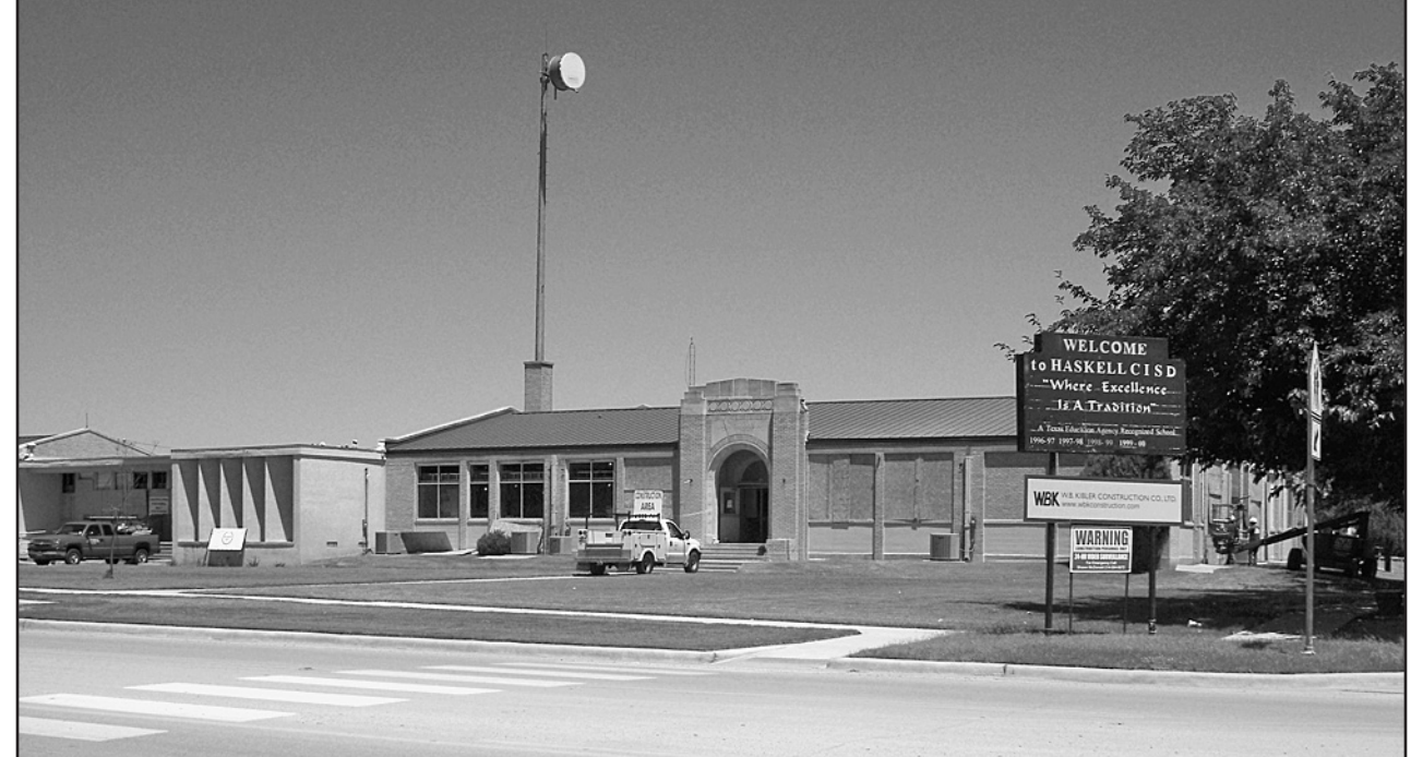
Haskell High School continues with plans for the November.

An open house, to showcase the improvements will be held when the project is completed.