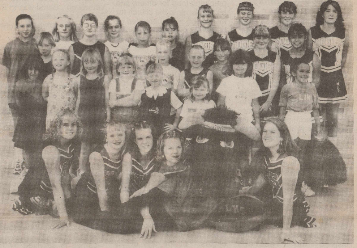
These young ladies joined the Robert Lee High School and Junior High School Cheerleaders at the Mini Cheerleading Camp held earlier this month.

The current drought is taking its toll on wildlife as well as residents, yards, pastures, and water levels. This better-than-average whitetail buck apparently came to town for groceries and was killed by a car or truck earlier this week at East 4th Street and Hwy 208 in Robert Lee. It's a little early for buck fever, but the heavy buck sported a really nice rack and was still in velvet.