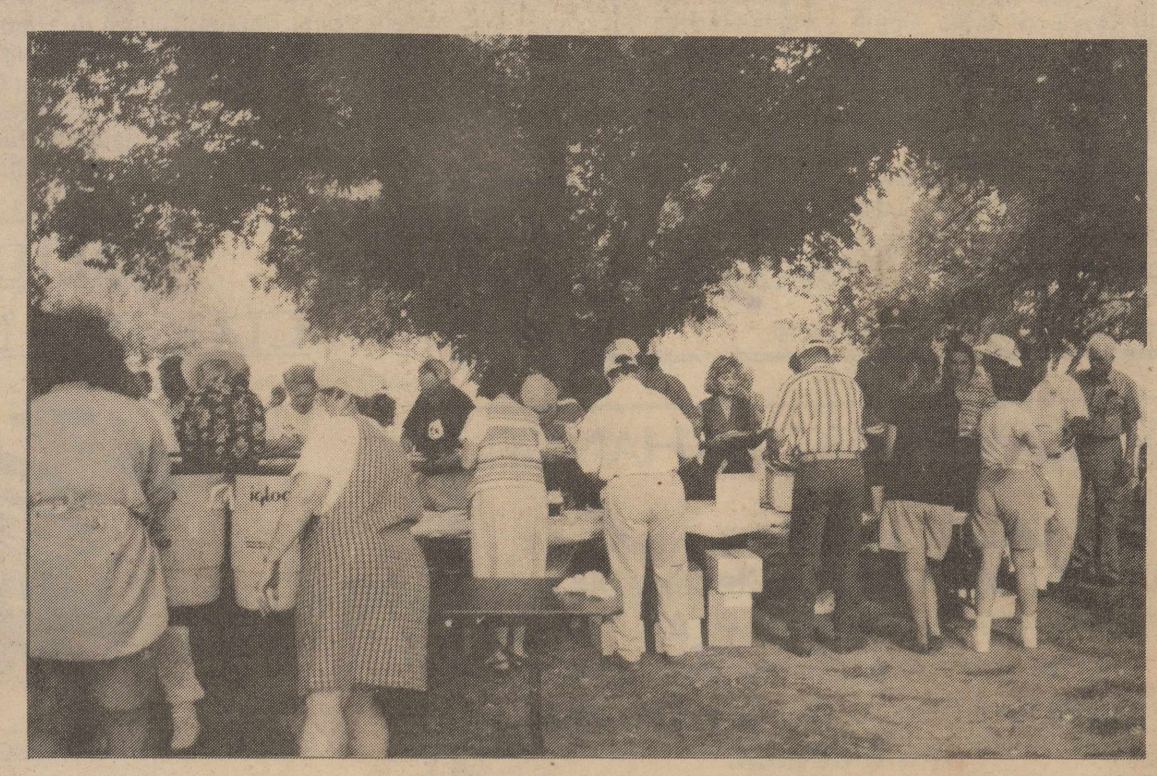
Participants file through the grub line during Friday night's banquet.