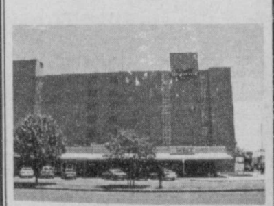
Come By & Take A Tour & Register to Win a Prize Just Relax or