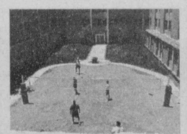
Fun In The Sun On The Court