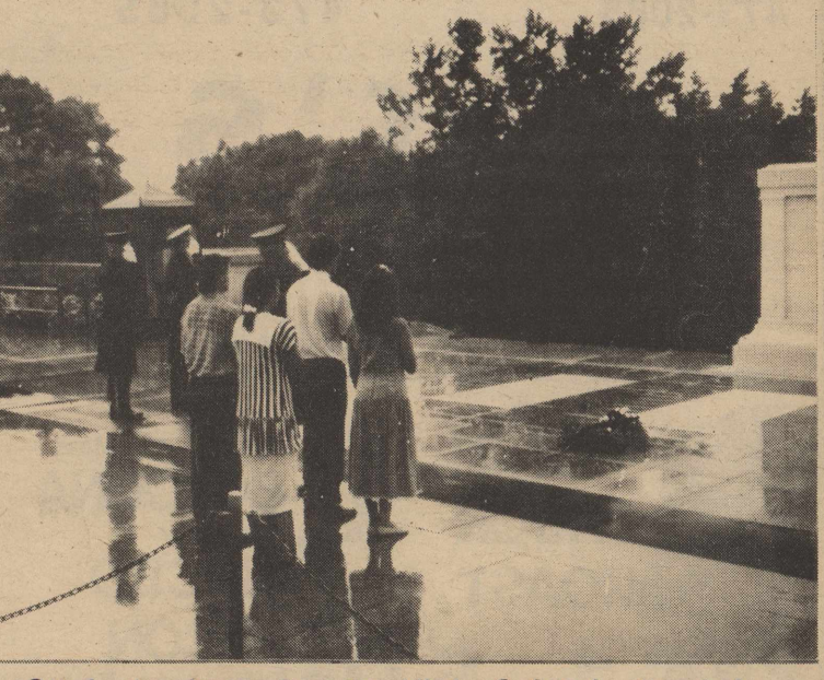
Students from Bronte High School stand in silence during the Wreath Ceremony at the Tomb of the Unknown Soldier at Arlington National Cemetery.