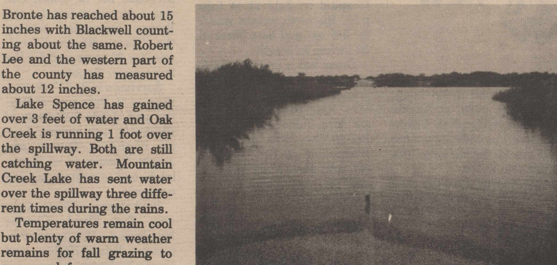
OLD HIGHWAY 158 disappears as rising waters from Lake Spence wipes out the Wildcat Creek Bridge. A short time ago, it was open to traffic and fishermen were sitting in lawn chairs along the sides.

Temperatures remain cool but plenty of warm weather remains for fall grazing to grow and farmers are anxious to finish their harvest and plant small grains, but no one wants to rush the end of the good rains.