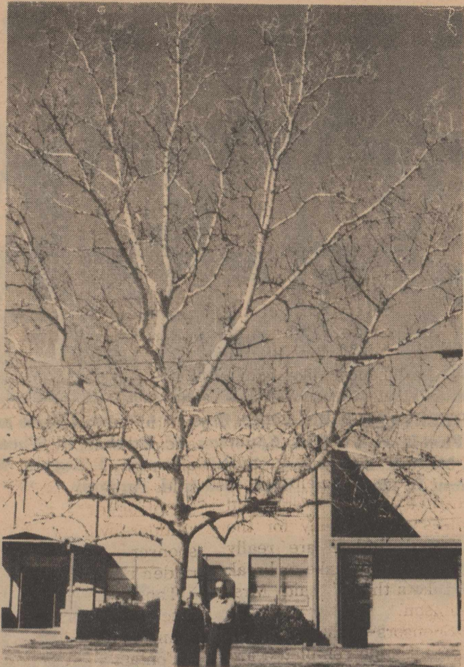
THE ABOVE SYCAMORE tree was planted forty-nine years ago, Feb. 22, 1937, by members of the Diversity Club to commemorate Arbor Day. The towering tree on the Bronte School grounds has provided cooling shade for many students and teachers over the years.

Plans are currently underway for HC to produce Snow White in conjunction with the Texas Tech University Theatre in Lubbock sometime in April.