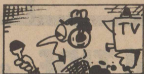
The first Presidential news conference to be televised was held by President Eisenhower on January 19, 1955.