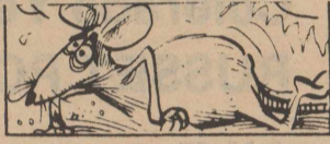
A rat can go longer without water than a camel can.

Survivors include one son of Austin, and one sister of Midland.