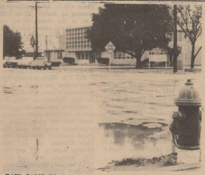
RAIN CAME TO Coke County Sunday and Monday and left