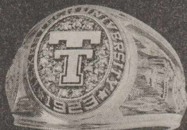
WOMEN'S TRADITIONAL (WITH OPTIONAL PAVE PANEL)