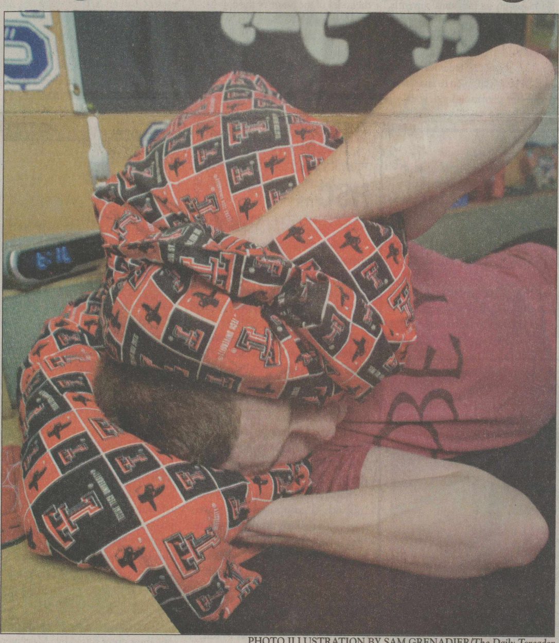
NOT HAVING A routine sleeping pattern can cause a person to not get the proper amount of sleep, which can lead to problems with concentration, memory and cognitive function.

people say, 'Oh, somebody's got and cognitive function. He said weekend is over, it's the majority tion, personality is affected. of people get sleep later on Sun-