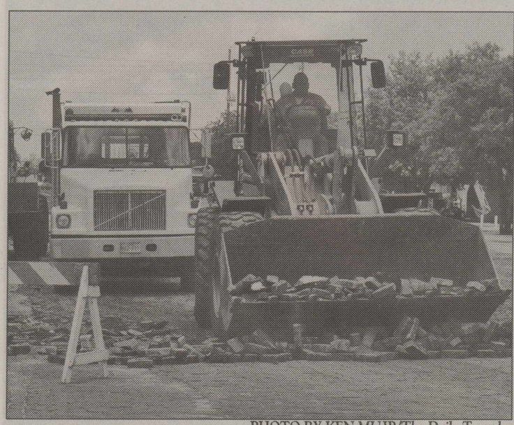
CONSTRUCTION CREWS TEAR up the bricks on Main Street Thursd-