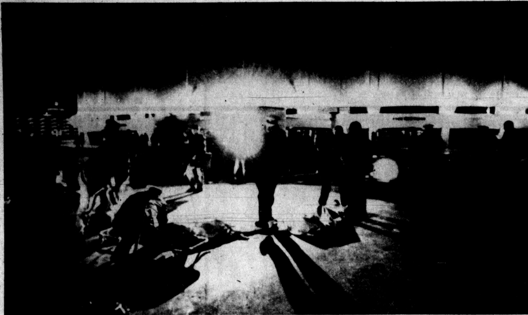
Police cover the bodies of two people on the plaza area of Cincinnati's Riverfront Coliseum Dec. 3, 1979, after 11 people were killed as a crowd surged to get in to a rock concert. The city has taken precautions to make concerts safer.