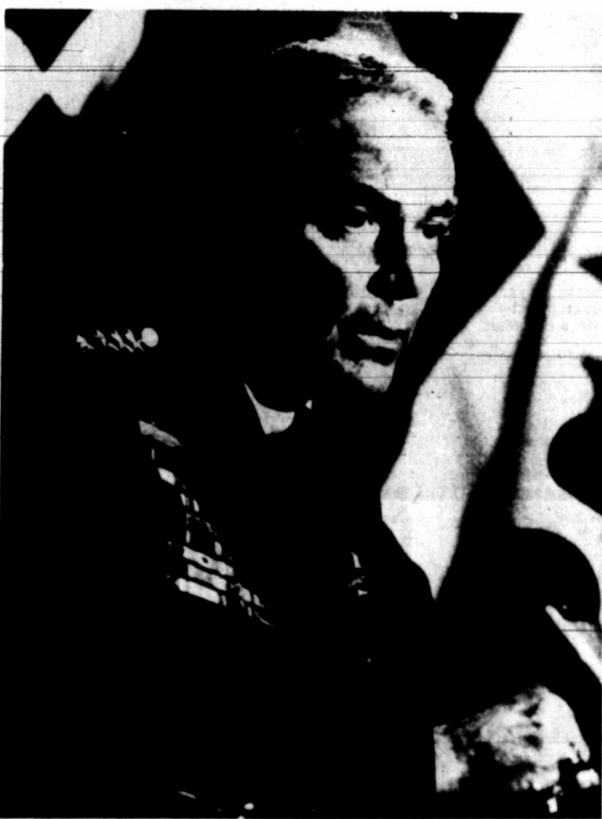
Alexander M. Haig, reported to be Reagan's top choice for Secretary of State, is shown here speaking at his last press conference before retiring as NATO's supreme military commander in 1979.

WASHINGTON (AP) — Alexander M. Haig Jr., the general who helped Richard Nixon through his worst moments in the White House, is President-elect Ronald Reagan's first choice for secretary of state, source report.