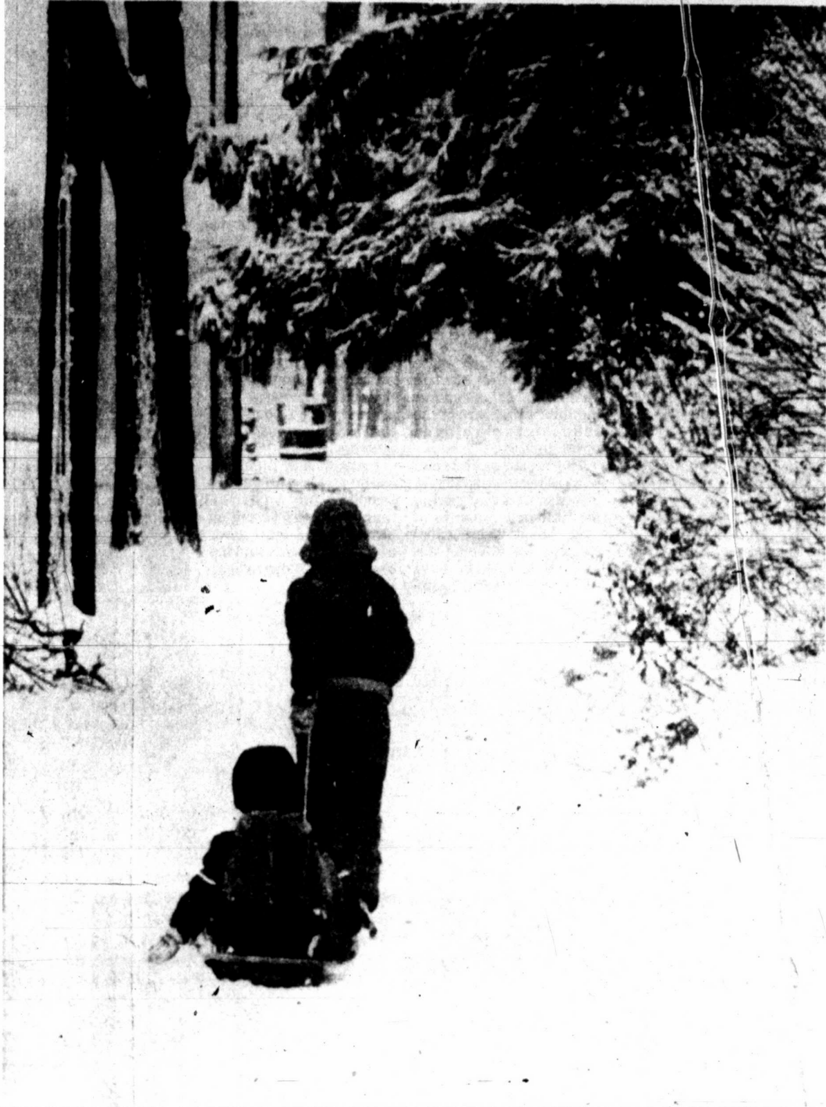
Two Madison, Wisconsin, youngsters were up early Tuesday to explore the five inches of snow dumped on the city the night before.