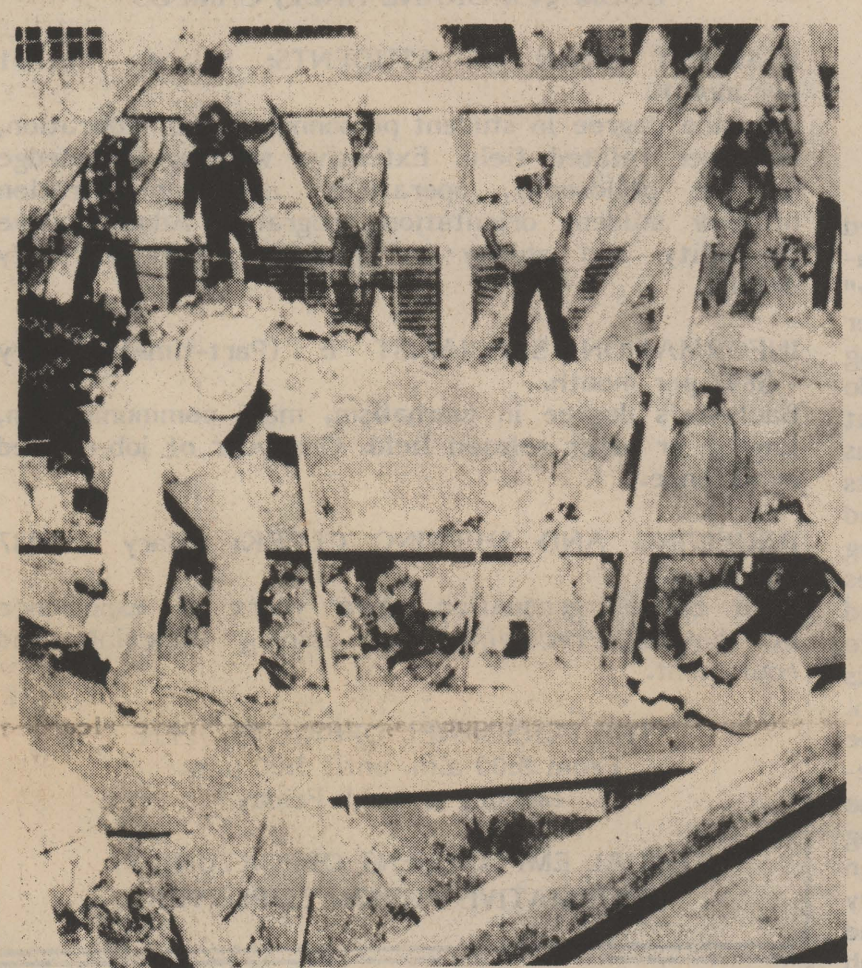
Trabajando Contra el Tiempo

El astro de la ópera Plácido Domingo, que es oriundo de España pero se crió en México, envió un emotivo mensaje bilingue desde México donde perdió a cuatro miembros de su familia en los terremotos.