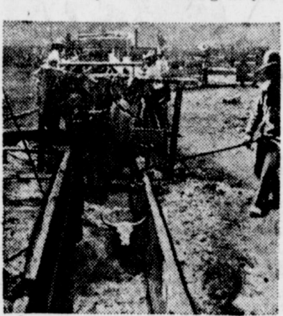
Dipping method is favored by some cattlemen to control grubs and other infestations.

penetrated their mouths and throats that it was only merciful to destroy them. Several porcupines have been reported in the area. Egg yolk is an excellent source of iron. Eggs are also rich in vitamin A and contain thiamin, riboflavin and vitamin D.