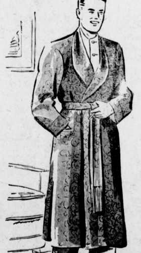
SHINY SATIN CREPE $2.50

$19.95 Lovely sheer rayon beautifully lined! Maroon, blue