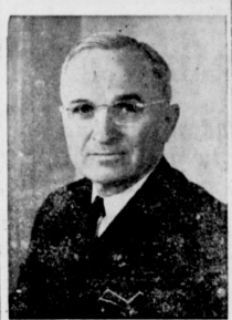
Harry S. Truman President of the United States

PRESIDENT TRUMAN has issued a message to all 4-H Club members, who are observing National 4-H Club Week, March 1-9. The President said: "We are proud of your 4-H Clubs which spread across our great Nation. They constitute an outstanding body of youth aiming to attain worthwhile goals in life. 4-H Clubs have become a significant influence in developing the cultural, social and recreational, as well as the practical aspects of modern rural life. As a character-building influence they are unsurpassed."