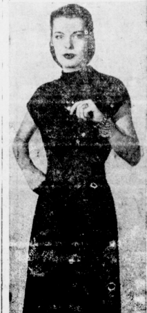
A simple, two-piece wool dress in a basic color—black, brown, dark green—provides opportunities for many wardrobe changes. When you make your own clothes it is easy to choose styles and colors that will mix-match well, and save for Victory Bonds. Patterns at your local stores. U. S. Treasury Department