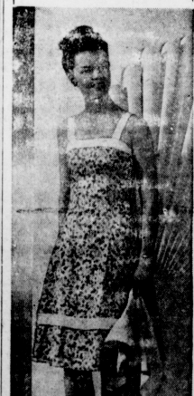
It's open season for cotton. Choose a flower design for the bare-shoulder dress, and crisp white for the bolero. By sewing for yourself, you are helping to win the war. Sew only what you need, and dig down deep in your pockets to buy that extra War Bond.