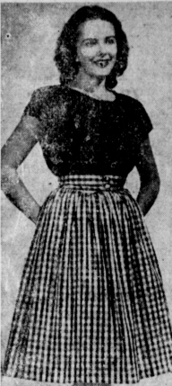
Peasant styles, popular for summer wear, have been dressed up for the winter season. The brown Jersey blouse has a low drawing neckline and slit dropped shoulders. Similar patterns at local stores. Buy Victory Bonds with the money saved. U. S. Treasury Department

the Christ, the Son of the living God," believing that a real heart-grip of that, with all it implies, will lead to a complete surrender of life and will to Him.