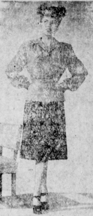
The trim smartness of this racy-pink and black jacket dress, with its wide shoulders and full sleeves, can be duplicated by a business-woman well-dressed and patriotic, too, buying War Bonds with your savings by sewing.