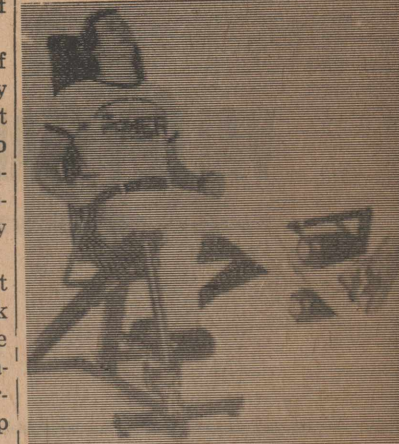
KNEE MACHINE か ☆ ☆