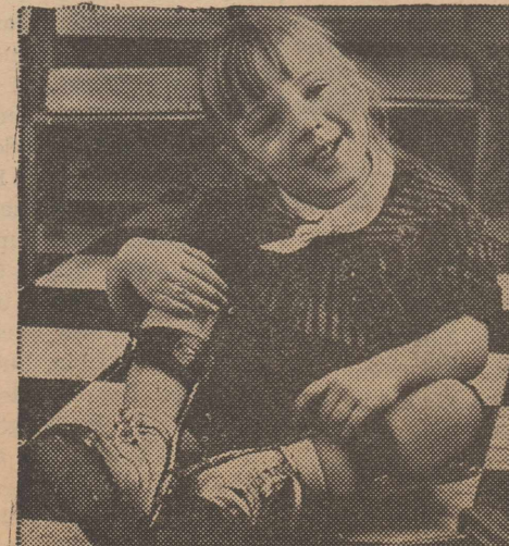
Try me—I'm willing to get better

If you know anyone who needs this therapy, send them to your local Easter Seal Society.