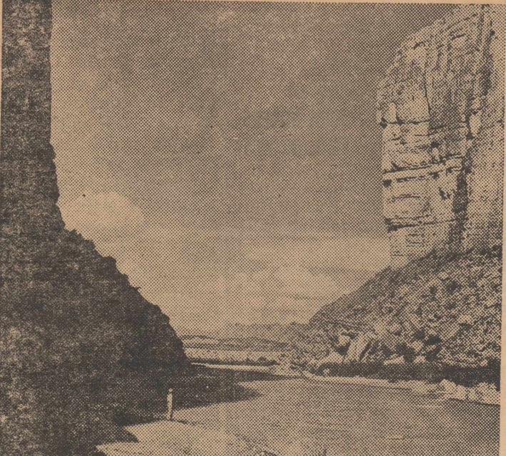
SANTA ELENA CANYON — Thousands of Texans are still "discovering" the awesome wonders of Big Bend National Park, south of Alpine, Brewster County. Here the Rio Grande cuts a 1,500-foot-deep canyon, with Mexico on right and U.S. on left.