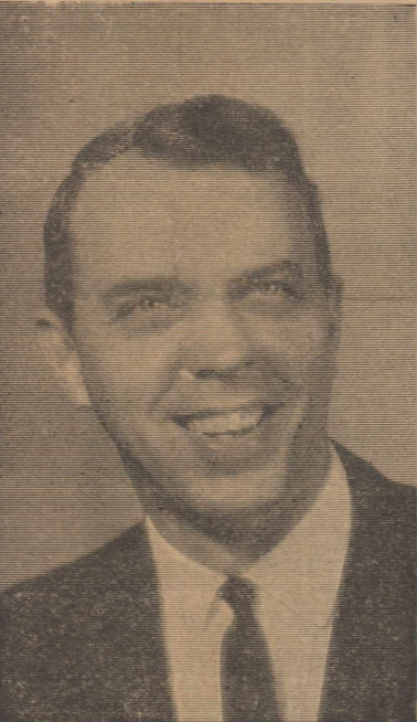
STATE SENATOR ANDY ROGERS