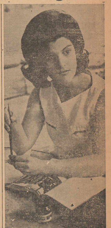
LUCI BAINES JOHNSON, the President's younger daughter, at her desk in the White House, as she began her duties as honorary chairman of the Teen Age Program of the 1965 March of Dimes.

Luci Baines Johnson, America's most famous teenager, will be honorary chairman of the 1965 March of Dimes Teen Age Program against birth defects. Luci, who has some very strong opinions about young people and their place in society, is leading a task force of thousands of young people in the fight against birth defects.