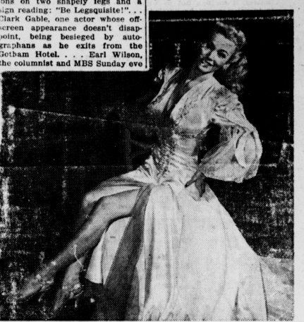
CAROLE LANDIS Packs Her Chest