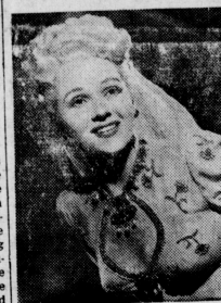
LA JERGENS 1000 plus one nights veterans: "Assignment Home," and "Opinion Requested."

stroller: Commander Gene Tunney. . . Thrill: The ride in the miniature train in Bronx Park. . . Recommended: radio's two best bets in programs designed for returning