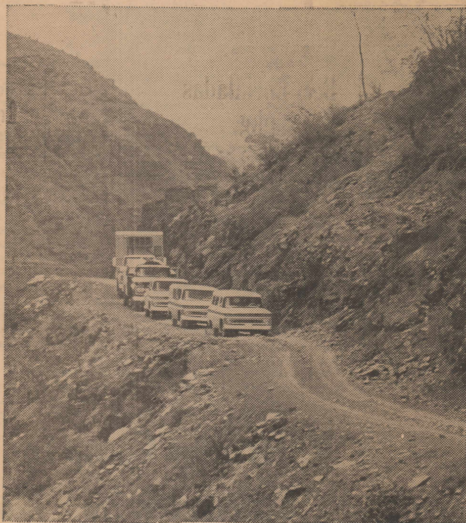
Sometimes the caravan crept along for hours in low gear. It took 17 days to go 1,066 miles! This is the road near Loreto.

...THE ONES THAT WHIPPED THE BAJA RUN...TOUGHEST UNDER THE SUN... TO SHOW THE WORTH OF NEW ENGINES, FRAMES AND SUSPENSIONS!