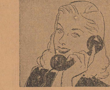
TELEPHONE? Electricity carries your voice along the wires and rings the bell at the other end.