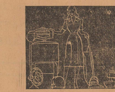
HOME APPLIANCES? Electricity makes TROLLEY CARS? Horses pulled 'em once, but electric horsepower does a faster, 'em work-heats, cools, freezes, lights, cleans, entertains—and then some!