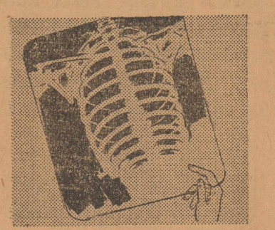
X-RAY? The X-ray itself is actually a special kind of electricity—and that's no rib!