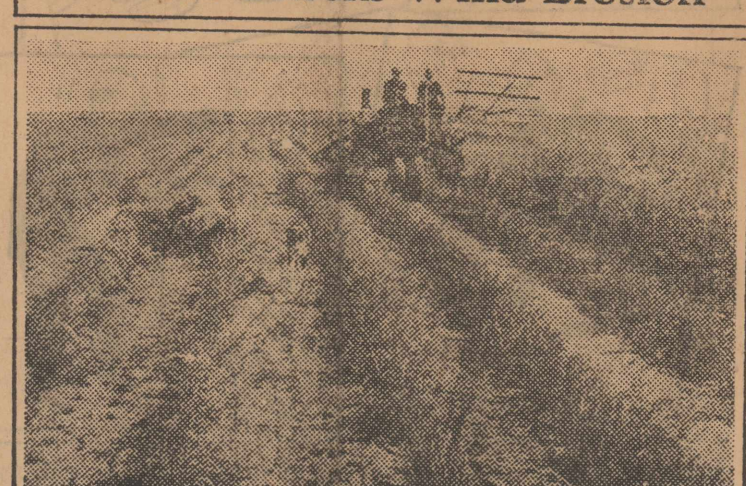
Stubble of Sudan grass or any of the other sorghums, when protected from overgrazing by livestock, binds the soil and prevents erosion during the period of high winds, the Soil Conversation Service points out. This farmer, cooperating with one of the demonstration projects, is leaving a stubble from 8 to 12 inches tall as he harvests his Sudan grass crop for