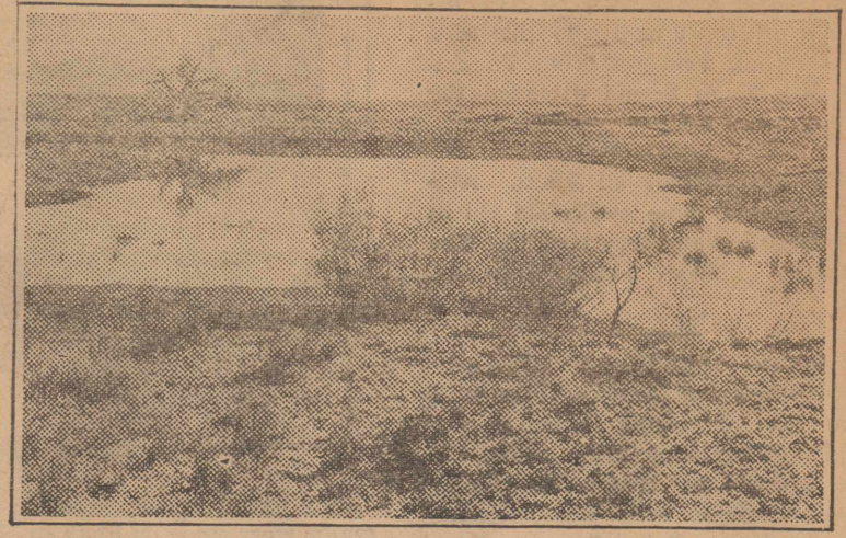
Stock ponds not only provide water for livestock, but distribute grazing if properly located over the range. By catching and holding water, Soil Conservation Service points out. The ponds also provide a haven for water fowl and in many instances serve recreational purposes.