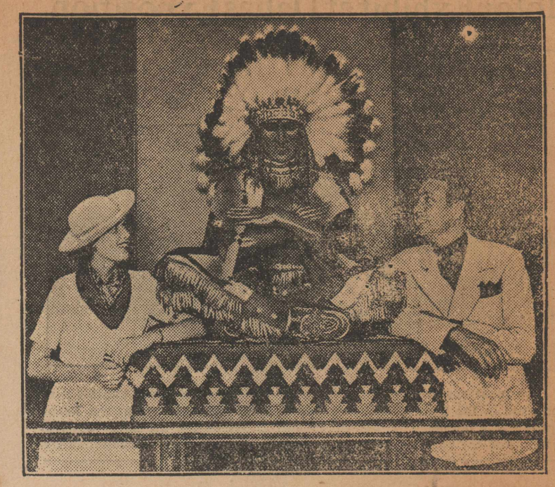
In the General Motors Exhibit at the Texas Centennial Exposition at Dallas is the famous "Chief Pontiac," mechanical Indian, who answers questions asked by visitors. Beside him are Phil Harris, orchestra leader

To drive a million miles is someby only a very few persons. To children so little is because t drive that many miles without a ma- afraid to expose their ignor jor accident is even more rare. To drive this distanc without even sc-1 raping a fender seems almost an impossibility.