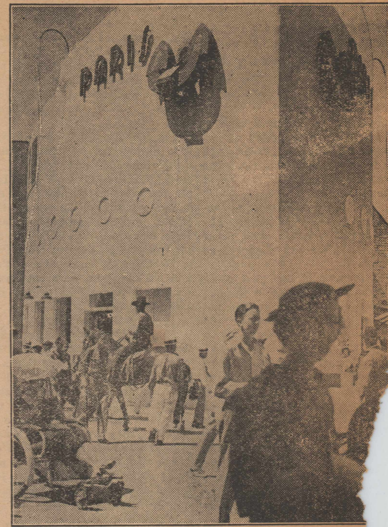
BOAT CENTER OF FAIR FUN SPOT.—An exact reproduction of the lines of the liner Normandie forms the front center of "The Streets of Paris" spot of the $25,000,000 Texas Centennial Exposition which was in Dallas until November 29. Flanking the ship is a French Village to an open-air court of concessions.

wouldn't believe it would make seven of them more prosperous to give all the credit to one, and in turn let him loan money to the others and live off them through the interest route would you? Good old Uncle Sam I think has been persuaded into that very thing. The producing farmer seems to be the "Goat." I will quote the facts and figures next week.