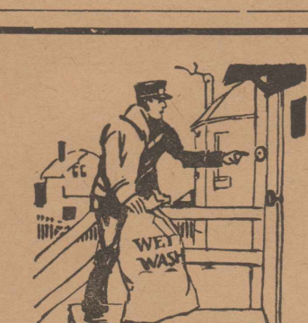
Banish Wash Day

There are 32 civilian seaplane bases in the United States.