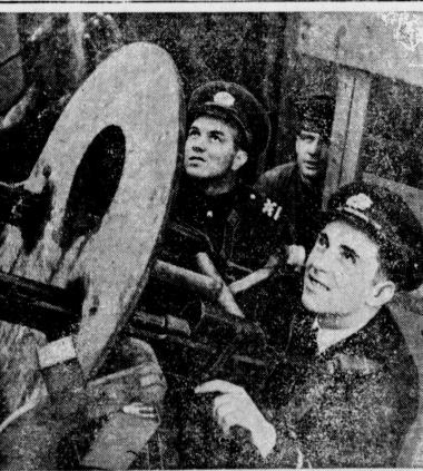
GREEK MERCHANT OFFICERS manning an anti-aircraft machingun aboard a Greek freighter watch for enemy aircraft. In spite of the peril of bombs, mines and torpedoes, 300 Greek steamers are speeding supplies to United Nations forces all over the world.