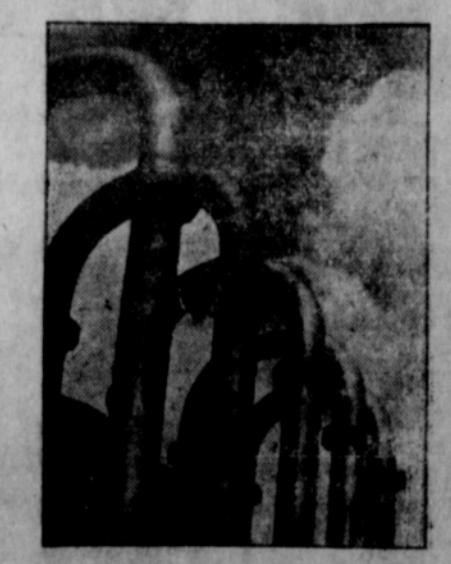
Photograph of Compressor Pipes by rgaret Bourke-White from FORTUNE

So your heat is not an impersonal thing. It is an hour-by-hour service, watched over constantly. Through this care and attention it stays so inexpensive that 15 cents' worth a day is the year around average household requirement for heating, cooking, refrigeration, and hot water supply.