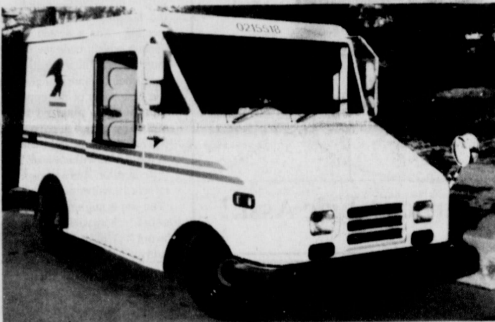
NEW POSTAL VEHICLE-- Shown is one of three new Grumman "LLV" (long life vehicles) recently received by the Cisco Postal Service to be used by city letter carriers in the delivery of the mail. They are taller than the old vehicles, and the Postal Service has asked customers to trim tree limbs that hang over the streets which might damage the new vans.

Voters face only one "housekeeping" constitutional amendment proposition, for a change.