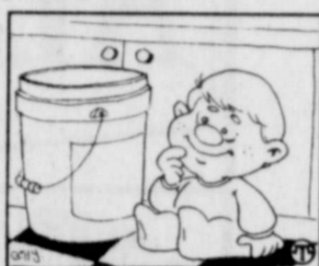
Never leave a small child alone with any large container of liquid.