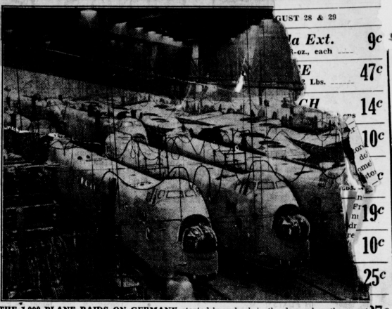
THE 1,000-PLANE RAIDS ON GERMANY started 'way back in the days when the va was biltzing Britain, Gigantic aircraft factories were secretly but efficiently built in Brwork to forge the avenging weapons. As revealed in this picture, the enormous 4-motor lages roll forward on duplicated—and triplicated—assembly lines looking like railroad mass-production. Today there are enough of these British-built Stirlings—and Halifax ters—to carry the offensive to the enemy and hasten the end of the years of "blood, sy